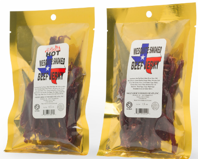
Beef jerky packages labeled with the ELF-20 shown with customer permission

In strict compliance with Good Manufacturing Practices (GMP) standards, the ELF-20 is made of 304 stainless steel and anodized aluminum, and carefully treated to guard against the effects of harsher environments. Additionally, its simplistic design enables quick fixes and easy adjustments. Given this durability and easy maintenance, the ELF-20 affords you a solid choice in labeling machine longevity.