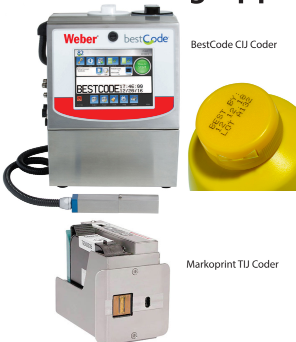
BestCode CIJ Coder